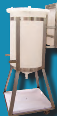
CHEMICAL MIXING TANKS