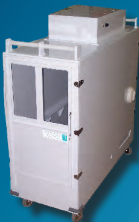
LARGE ANIMAL TRANSPORT