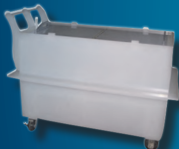
ROLLING SOAK TANKS